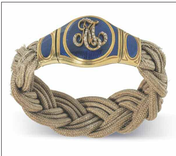
Bracelet with MT monogram; hair, gold, enamel, and rhinestones; c. 1840, MAD.

“Often friends came to spend the evening with us; one did not fail to make me dance, which would give me great pleasure [as] I would put on my short dress. Then I would compose many steps and assert that my professor had taught them to me; all were amazed. I really do not know what I was executing in front of them, but often I made them cry. When my mother played the harp, I would be-