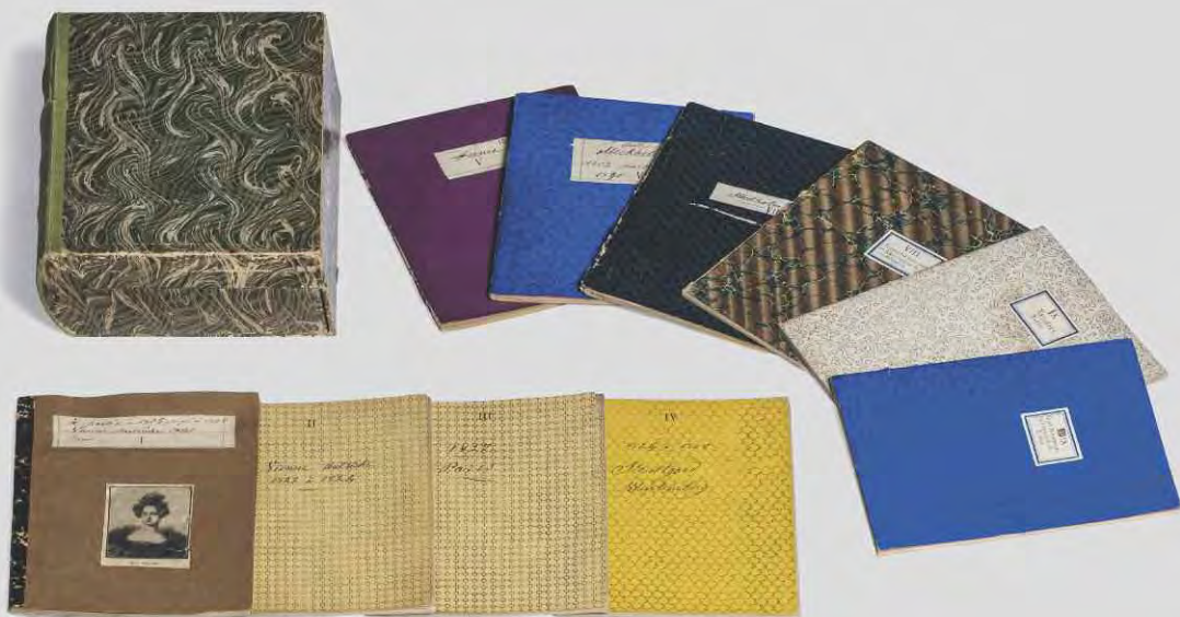
The Musée des Arts Décoratifs's Marie Taglioni notebooks with their storage case.