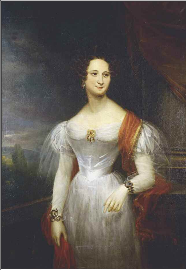
Portrait of Marie Taglioni, oil on canvas, c. 1840, Bibliothèque-musée de l'Opéra, Paris.