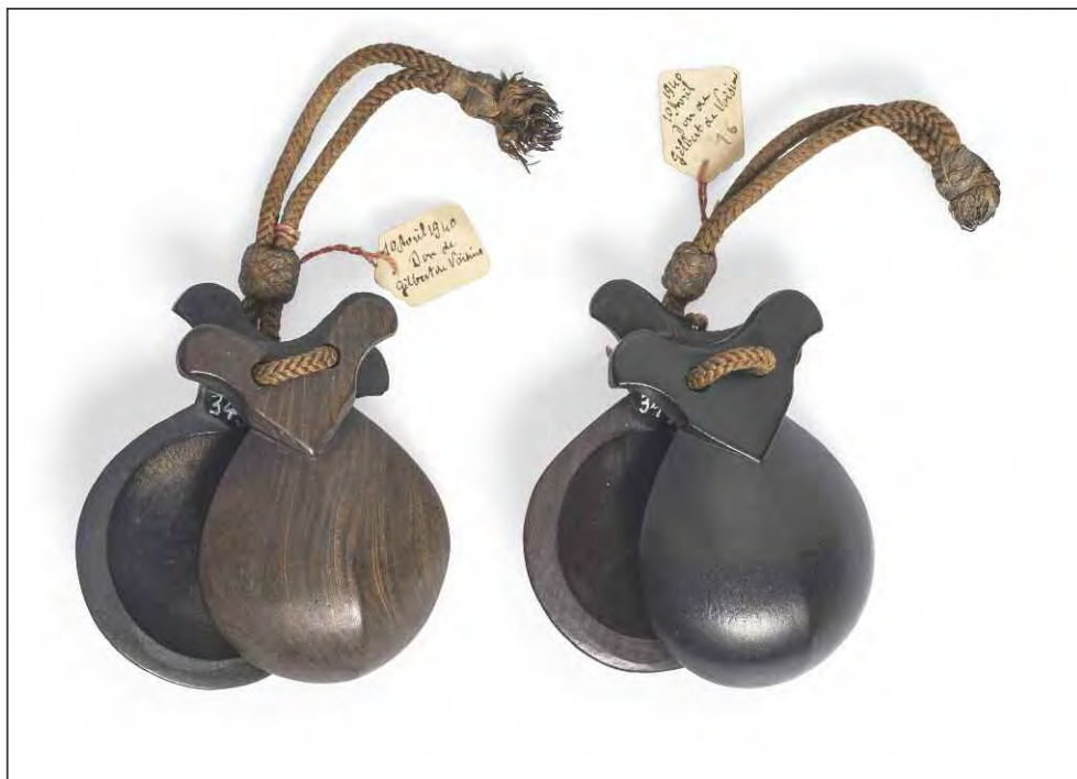
Castanets, ebony and guaiacum, c. 1840, MAD.

l'Opéra's Taglioni Collection. The latter is an autograph manuscript of Marie Taglioni's, consisting mainly of drafts, often with the word "duplicate" is written at the top of a page. Also interspersed are pages in another handwriting; apparently Marie shared her writings with a correspondent who sometimes made corrections or additions.