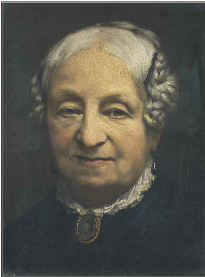
Portrait of Marie Taglioni, oil on canvas, 1870-1880, MAD.