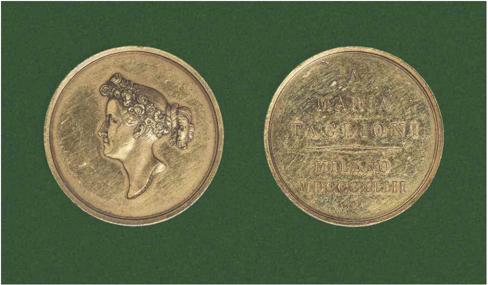
Medal of Marie Taglioni, gilt bronze, Milan, 1843, MAD.

more quiet, less jumping, and more graceful” 28