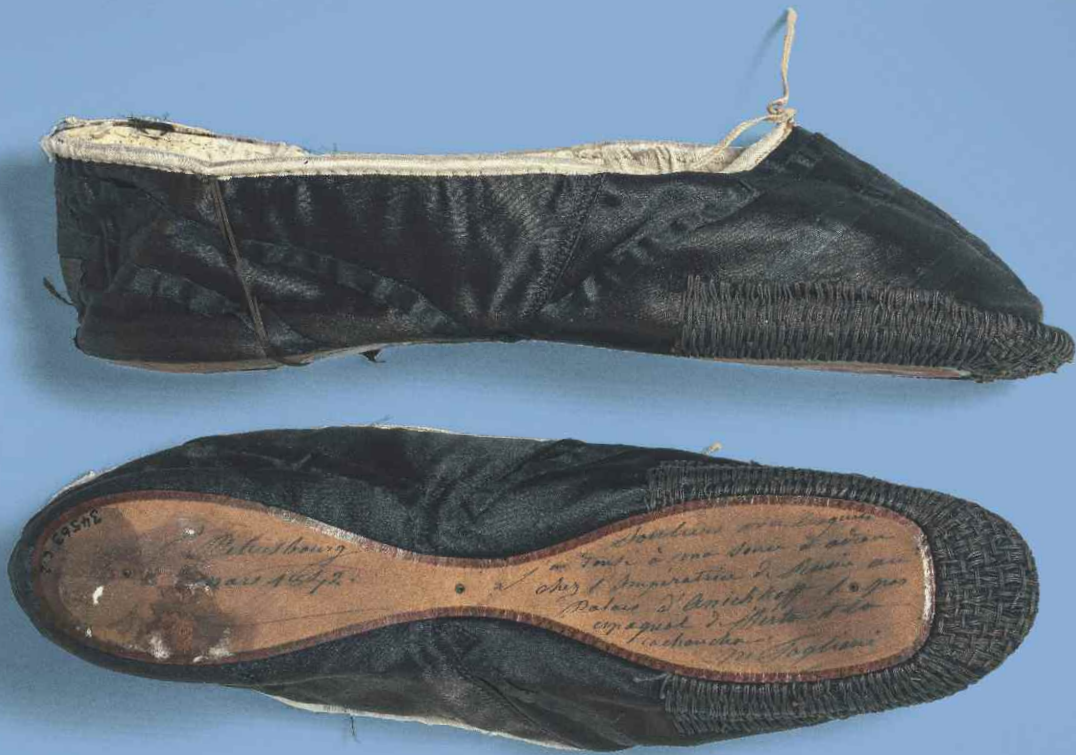
A pair of ballet slippers, 1842, MAD.