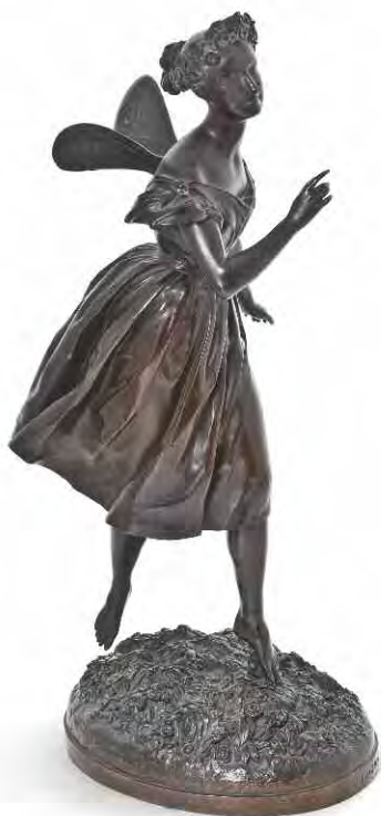
Jean-Auguste Barre: Marie Taglioni in La Sylphide , bronze statuette, 1837, MAD.

“Then two more hours were devoted to what I will call aplombs, or adagio[. T]hus I would take poses held on a single foot, which then had to be developed gently, when the pose presented great difficulties, I tried to keep it, and I counted up to a hundred before leaving it[. W]ith this perseverance, I mastered it com-